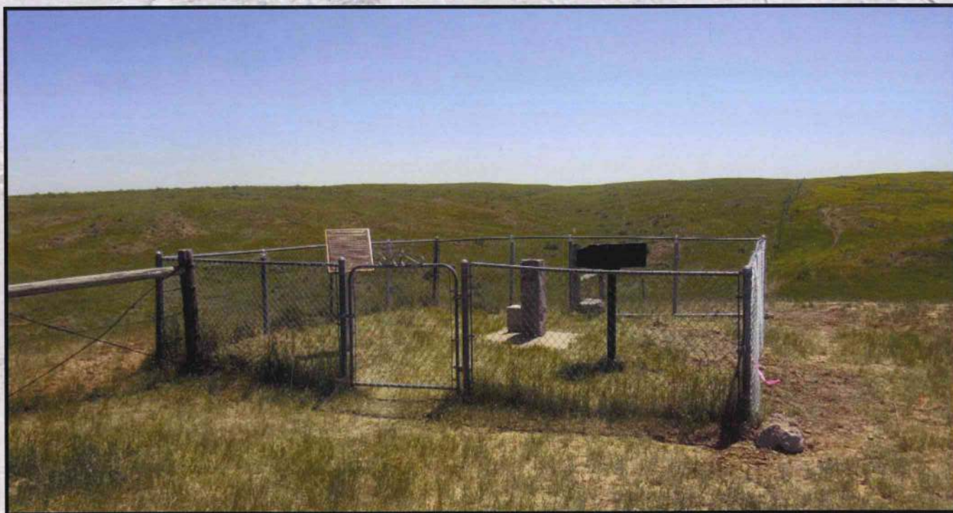
THE COMPLETED PROJECT